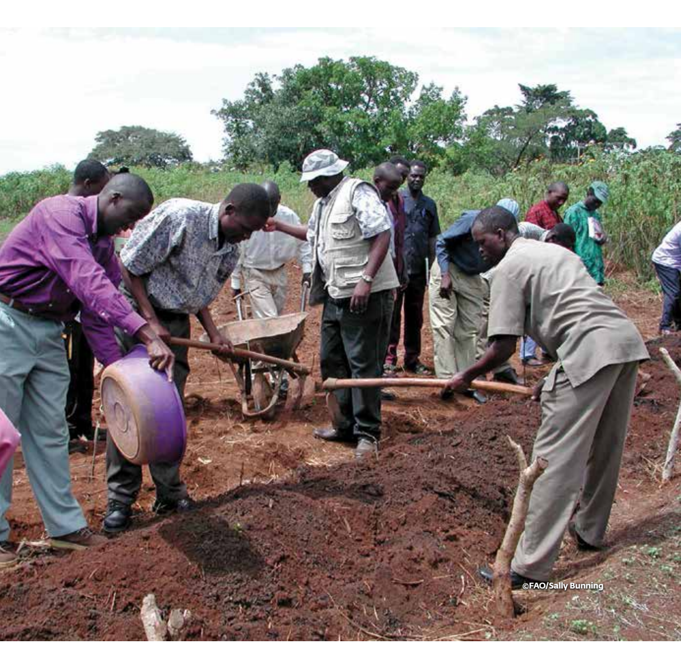
From the Abuja Declaration on Fertilizers to a sustainable soil management framework for food and nutrition security in Africa by 2030