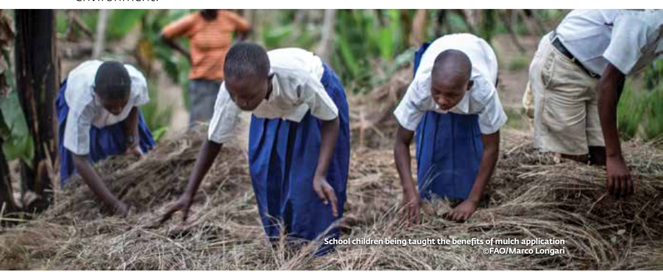
"It can take 100 to 1000 years for a centimeter of soil layer to be formed naturally, yet a few seconds to lose that same amount."

Goal 3 on Good Health and Well Being also has a soil related component in the form of target 3.9 to substantially reduce the number of deaths and illnesses from hazardous chemicals and air, water and soil pollution and contamination. Goal 12 on Sustainable Production and Consumption specifically mentions in target 12.4 the need to achieve the environmentally sound management of chemicals and all wastes throughout their life cycle, in accordance with agreed international frameworks, and significantly reduce their release to air, water and soil in order to minimize their adverse impacts on human health and the environment